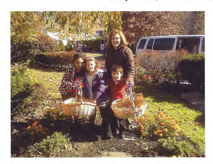
Having fun planting daffodil bulbs in honor of Veterans Day! Planting sponsored by Environmental Group – Thank you to Soup/Rummage Sale Committee for covering cost of bulbs.